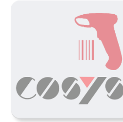
COSYS Cloud Inventory Management

Convince yourself and download the COSYS Cloud APPs without obligation from the Play or Appstore. On request, we will provide you with your own COSYS Cloud container with personal access.