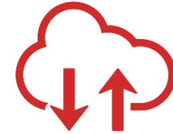
COSYS file import/export