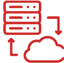
COSYS Cloud Sync