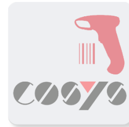
Management and Container